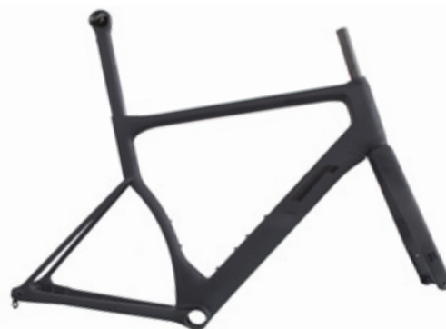
STRADA TEAM STEALTH