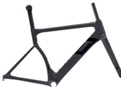
STRADA DUE TEAM STEALTH