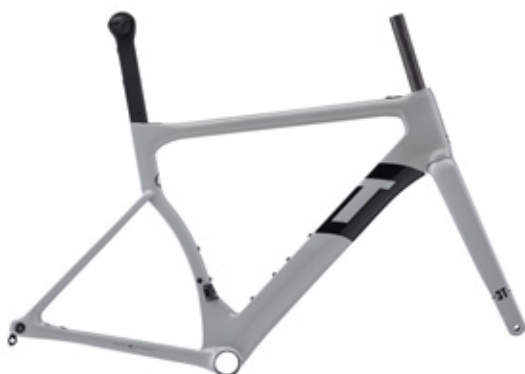
STRADA DUE TEAM